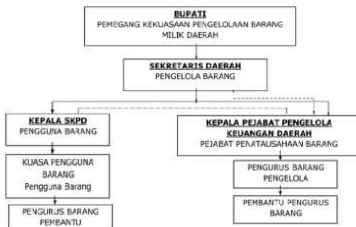
Fig. 2. Structure of Regional Property Management Officials

Scope of Regional Asset Policy Bogor Regency Government. In the organizational structure and explanation above, it is clear that the systems and procedures regarding the management of regional assets or regional property of the Bogor Regency Government are likely to carry out the systems and procedures properly and by the policies that have been designed. The structure of regional property management officials referred to is shown in Table 2.