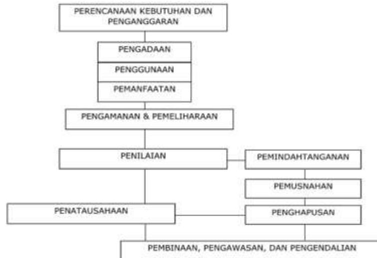
Fig. 3. Regional Property Management Cycle

Goods User, who is within the Regional Apparatus he leads; the Goods User submits the RKBMD proposal to the Property Manager, who examines the RKBMD proposal. Goods data reviewed by Property Users and Property Managers include Reports on the List of User Goods, Reports on the List of Metered Regional Property, and Annual Reports on the List of Regional Property. Furthermore, after reviewing the plan for the Need for Regional Assets, it is determined that the Property Manager is the basis for preparing the Work Plan and Regional Apparatus Budget, which will be submitted in reality by the fourth week of February.