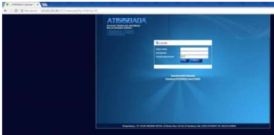
Fig. 3. Application of ATISISBADA

to facilitate detailed asset data collection. An illustration of the ATISISBADA application is shown in Figure 3, and the ATISISBADA System Entry Flow is in Figure 4.